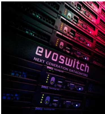
LeaseWeb’s rapidly expanding Data Centre

This proposal offered LeaseWeb the opportunity to build their own bespoke service, something which Goodman recognised that LeaseWeb were technically able to do. “Building your own IP transit service is not something we would propose to many organisations. Even if you have the required technical skills, it really is very time-consuming. Most customers definitely benefit from our broad range of co-location and web-hosting services as well as our pre-packaged internet services, which are easy to use and quick to set up. But we recognised LeaseWeb had evolved and were different and we responded accordingly.”